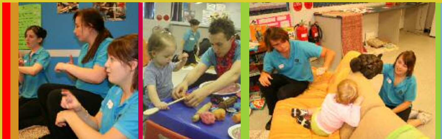
New, Purpose Built, Child Care Campus

Established in 1944, Bedford College is a well-established Registered Training Organisation with a long-standing reputation for excellence in a caring, friendly environment. The College places importance on attitude, respect, acceptance, tolerance, honesty and a belief that every person can achieve their personal best if they are provided with the right opportunities.